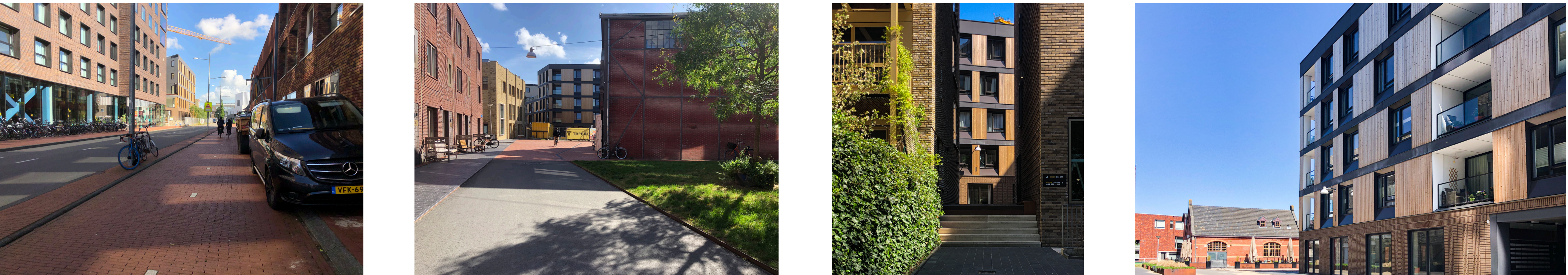
Relation to the neighborhood